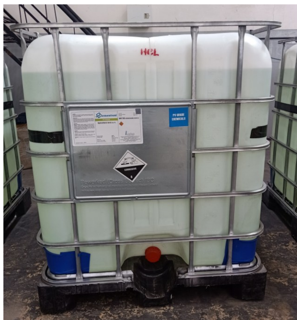
Figure 1: Hydrochloric Acid (HCl) PV grade stored in an IBC with proper labeling. As shown above, use of color coding is incorporated for easy visual identification (black taping for HCl). All HCl at our facility are stored with compatible material.