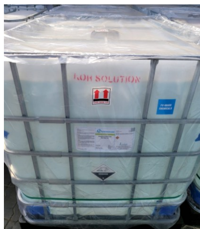
← Figure 2: KOH ready for transport in IBCs. Covered with poly bags to protect IBCs and contents from dust.